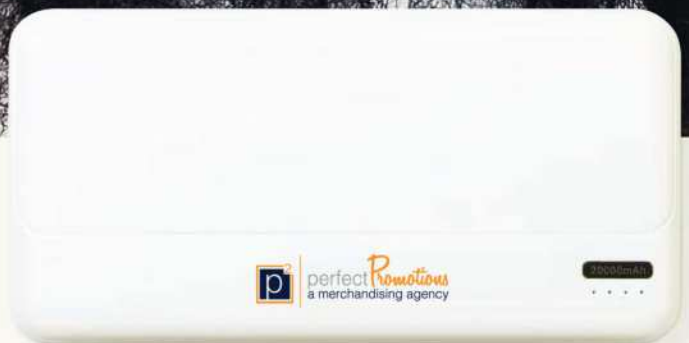
iLive 20k Power Bank