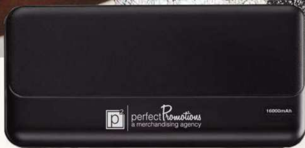
iLive 16k Power Bank