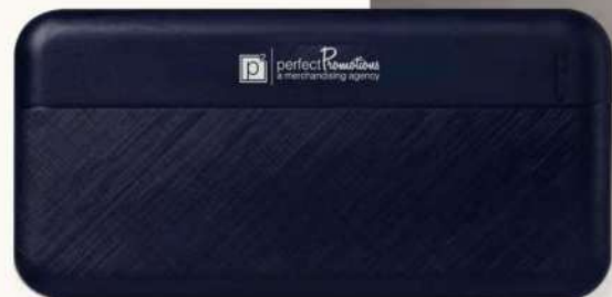
iLive 10k Power Bank