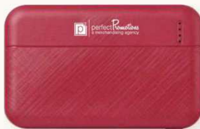
iLive 5k Power Bank

Keep any power-hungry device charged up with the portable iLive Power Banks. With two USB ports for mobile phone charging, USB-C and Micro USB ports for battery recharging, and a LED indicator light. Portable, powerful, and perfect at every capacity.